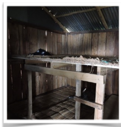
Accommodation: Mountain shelter with sleeping bags provided by us

US $300 per person (group size 2-6 people)