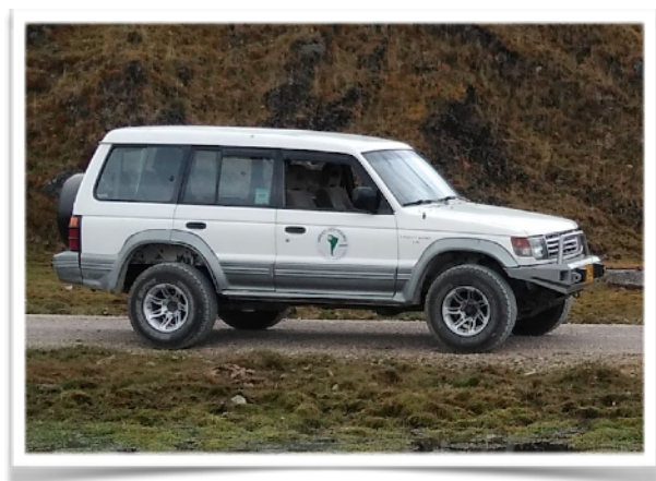
Transport: 4x4 high clearance vehicle

Packing list essentials: copy of passport, waterproof hiking boots that cover your ankles , sun protection, rain protection (umbrella or rain poncho), warm/impermeable jacket, gloves, scarf, 50 liter backpack (enough to carry your belongings and a sleeping bag that we will provide). We recommend the use of hiking poles.