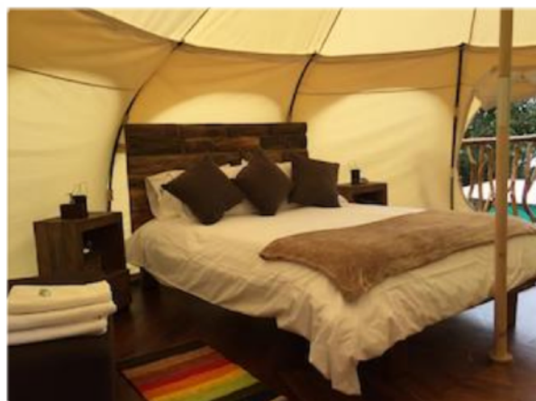
Accommodation: Private Cabin or Glamping with double bed & private bathroom

US $275 per person (group size 2-6 people)