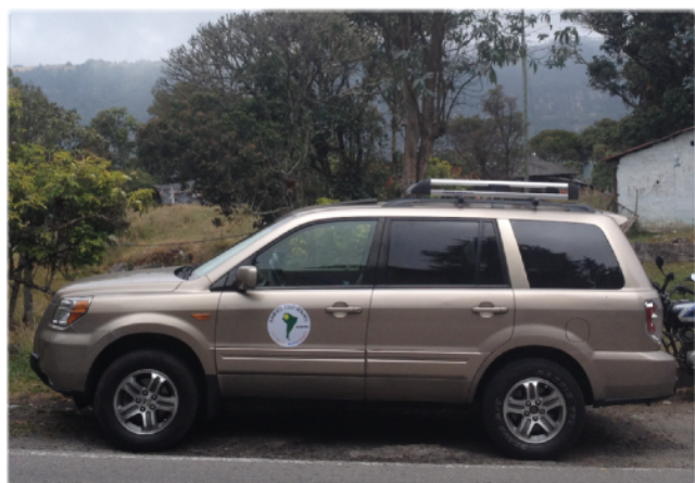
Transport: SUV, 4x4 with air conditioning

Packing list essentials: Copy of passport, hiking boots, local currency or credit card for snacks & meals, sun protection, rain jacket & sandals for the shower.