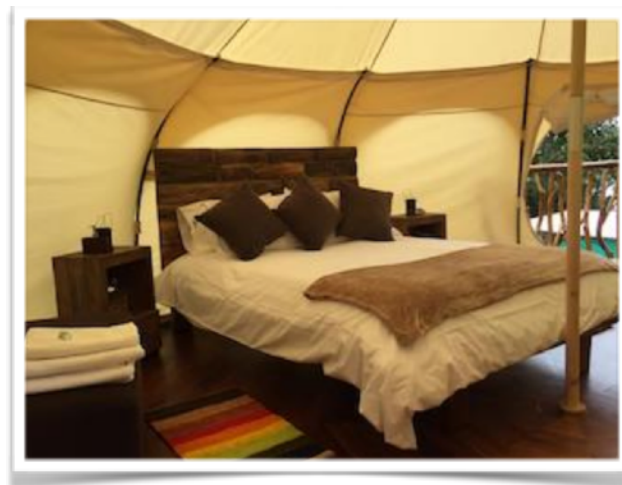
Accommodation: Private Cabin or Glamping with double bed & private bathroom

US $250 per person (group size 2-6 people)