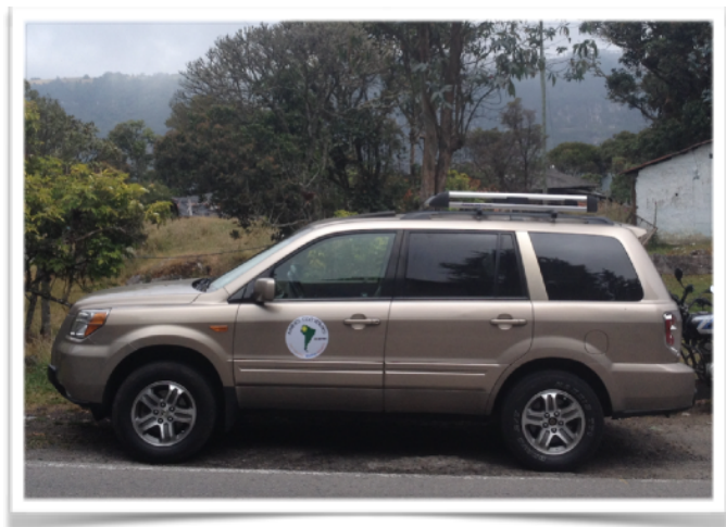
Transport: SUV, 4x4 with air conditioning

Packing list essentials: Copy of passport, hiking boots, local currency or credit card for snacks & meals, sun protection, rain jacket & sandals for the shower.